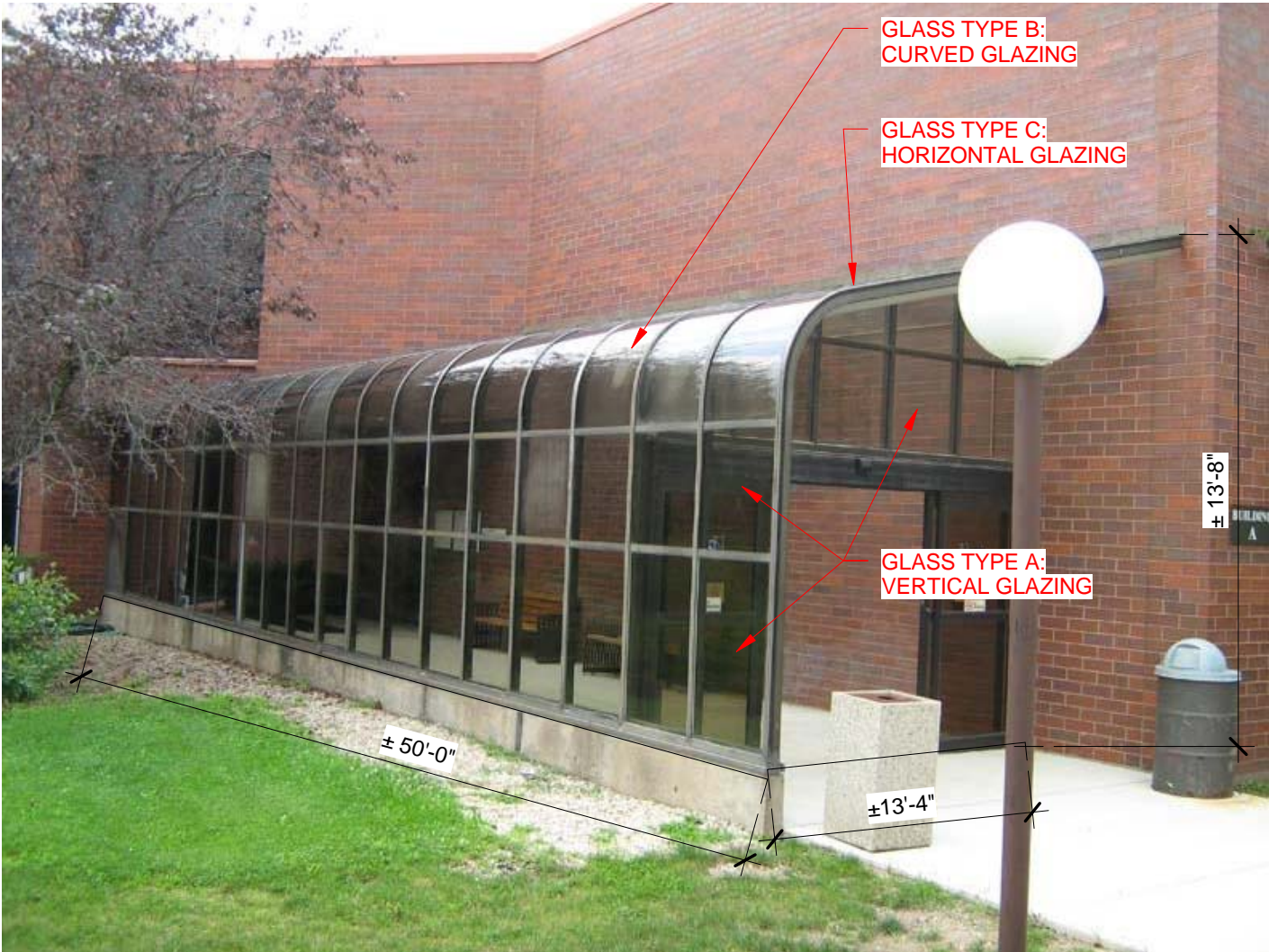
1 OVERALL ATRIUM IMAGE 1" = 1'-0"