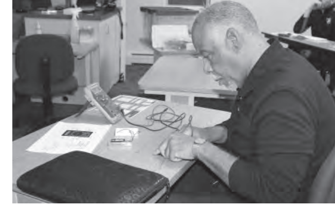
Circuit Electronics Class

Black Hawk College - Outreach Center (Outreach) 301 Avenue of the Cities, East Moline