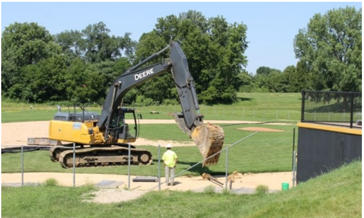
Excavator removing fence posts around the baseball field.

The first phase includes installing artificial turf on both fields along with illuminated turfed bullpens and illuminated batting practice cages. It’s scheduled to be completed in Spring 2023 in time for both teams to compete on the new playing surfaces.