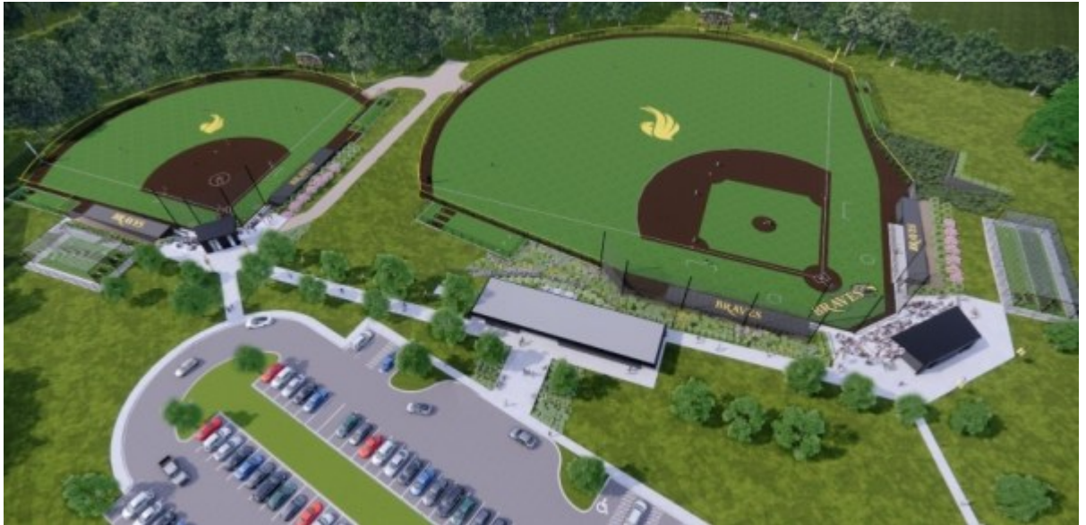
Artist rendering of new ballfield complex with softball field on the left and baseball field on the right.

A two-phase project will relocate the softball field from the east side of the Quad-Cities Campus to the west side of campus near the current baseball field. The new ballfield complex will include restrooms, concessions, batting practice cages and press boxes.