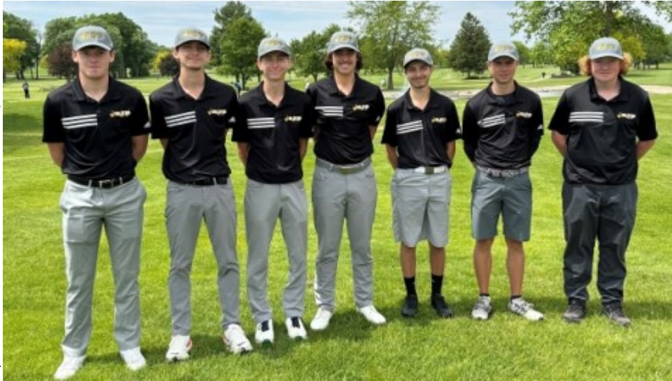
BHC golfers at the 2023 NJCAA Division II Men's Golf Championship in Plymouth, IN

For Spring 2023, the team earned an average GPA of 3.67, the highest of the eight BHC athletic teams. The golf team also had a 2022-23 average GPA of 3.14, the second highest of any BHC squad.